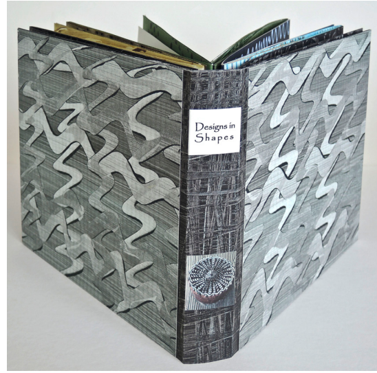
6.75" W x 6.75" H x 1.5" D

Designs in Shapes is part of a Paste Paper Pattern Series utilizing the binder's paste papers completed over 25 years.