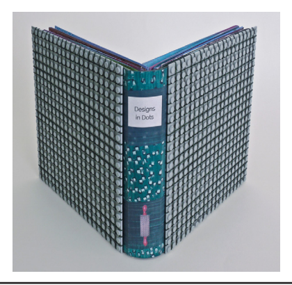
Part of a Paste Paper Pattern Series which also includes <u>Design in Dots</u> @2014 & <u>Design in Lines</u> @2015